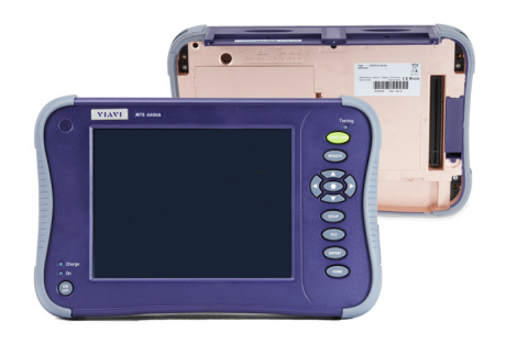
Back of the module carrier where other modules are attached

The multidimensional design of the T-BERD/MTS-6000A (V2) provides optimal configuration flexibility with extended battery life. The E6100 module carrier is best suited for fiber applications; whereas, the high-powered battery in the E6200 module carrier extends battery life when used with the carrier Ethernet (MSAM) or other intensive fiber applications.