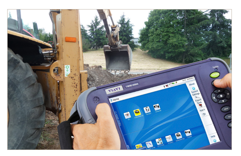
Portable and upgradeable platform with interchangeable test modules increases technician productivity

The flexibility of interchangeable module carriers and various plug-in modules let users create a platform that meets today's specific testing needs and yet it can evolve seamlessly to meet tomorrow's ever-changing network requirements.